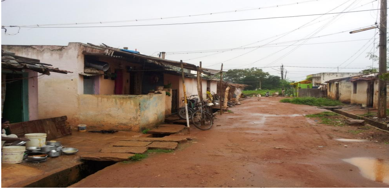
A View of Rajiv Gandhi slum in Tumkur city