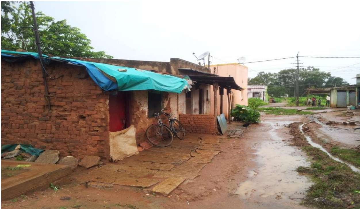
A View of Shettihalli AK Colony slum in Tumkur city