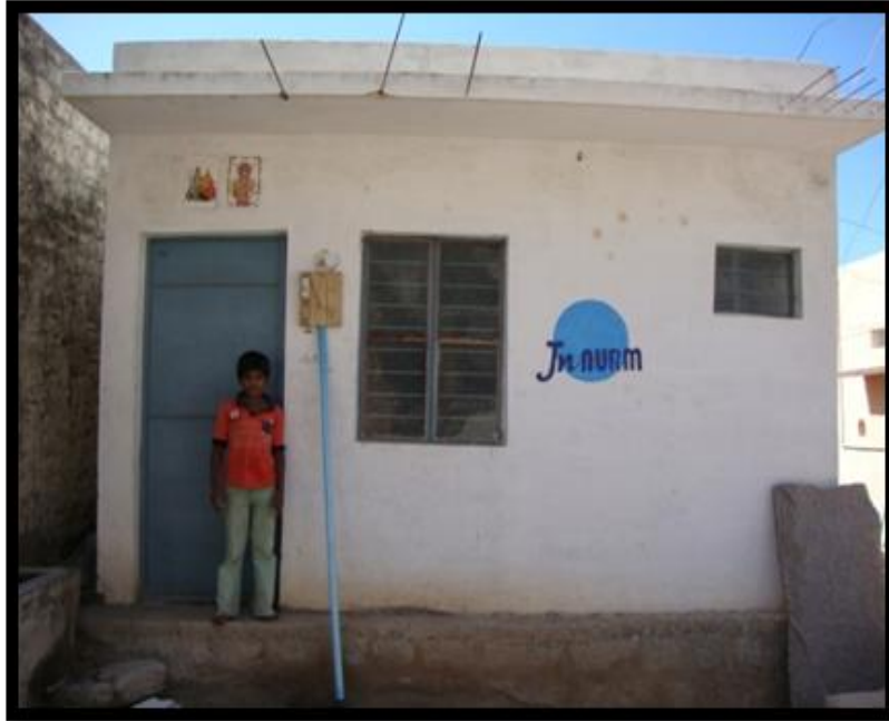
House Constructed under IHSDP Scheme at Bovi Colony Slum in Pavagada Town