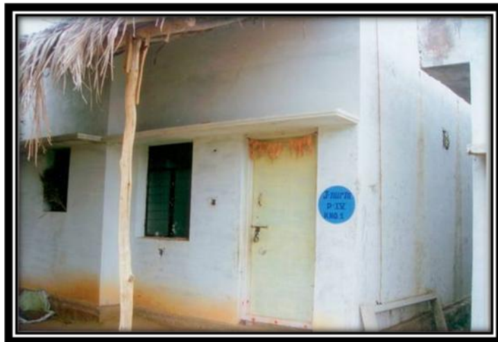
House Constructed under IHSDP Scheme at Sy no 5 Muslim colony Slum in Sira Town