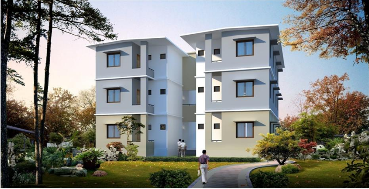
4 X 3 ELEVATION